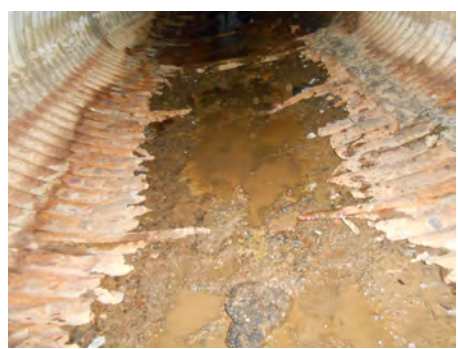
Severe invert corrosion