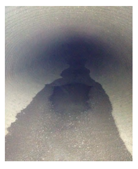
Final geopolymer pipe