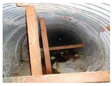
Asset owners had used timber as a temporary structural