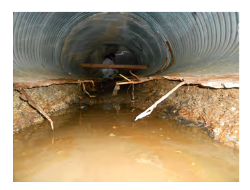
Invert needed to be repaired prior to application of geopolymer