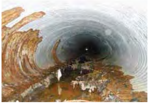
Severely corroded CMP invert

GeoSpray geopolymers helped the city restore a failing culvert to better-thannew conditions in less than two weeks with minimal distruption.